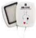
QUIK-COMBO Pacing / Defibrillation / ECG Electrodes