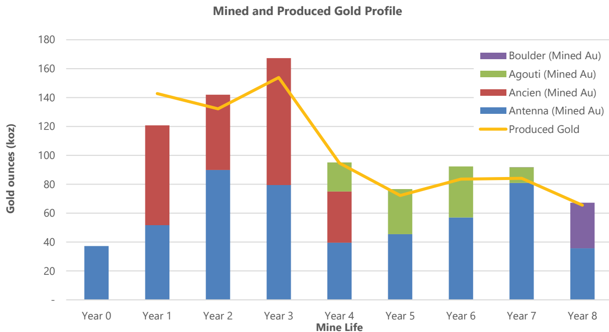
Figure 2: Séguéla PEA production profile

Mining activities at Séguéla will utilize conventional open-pit mining methods. Drill and blasting are planned for oxide and fresh mineralized material, followed by conventional truck and shovel operations within the pits for the movement of mineralized material and waste. Two 125 tonne (“t”) excavators, complimented with two 65 tonne excavators in the latter stages of the satellite pits, with an estimated total material productive capacity of approximately 8.0 Mtpa, will have sufficient capacity to allow for maintenance, transport between the pits, and make-up capacity to account for low productivity periods such as high rainfall events. A fleet of up to nine Caterpillar 777 trucks (payload of 100 t) will be used in conjunction with several smaller articulated trucks for the latter stages of the satellite pits to truck and haul all mineralized and waste material. Roxgold will engage a mining contractor for the mining of all the deposits over the mine life, several of which provided quotes that were incorporated in the mining cost assumptions in the PEA. A common pool of equipment will be used and scheduled across all active pits so that movement between the pits is minimised.