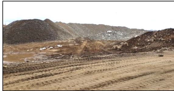
Screener and Gran B Select 1 Stockpile