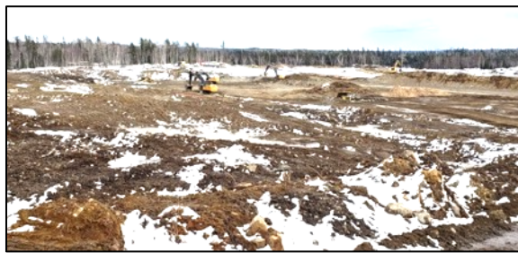
Open Pit development