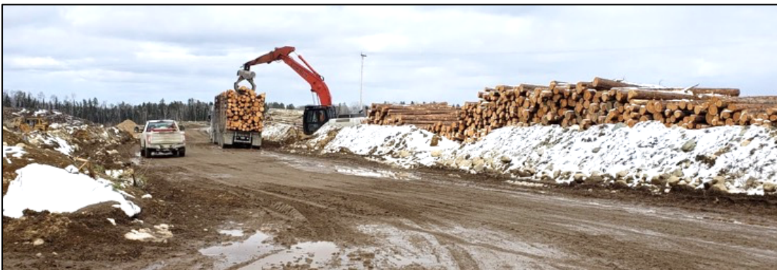
Loading and hauling of softwood