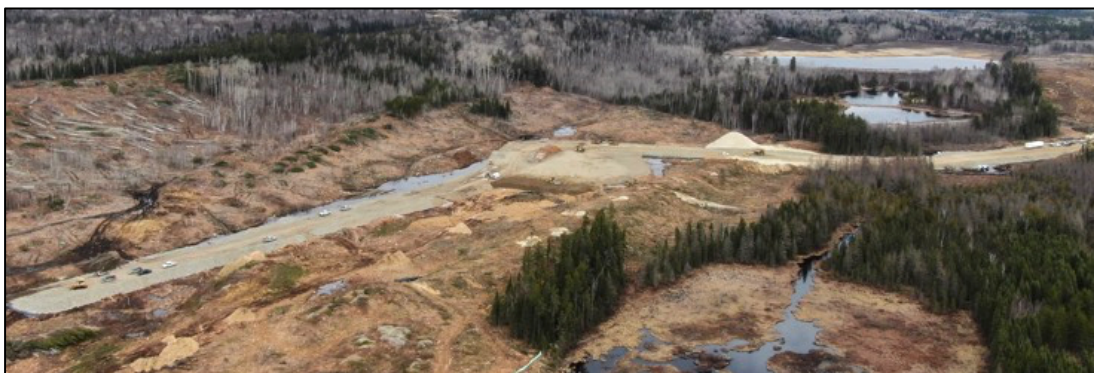
Haul road heading west from T-intersection