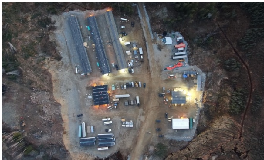
Site Construction Offices and Civil Earthworks Contractor Camp